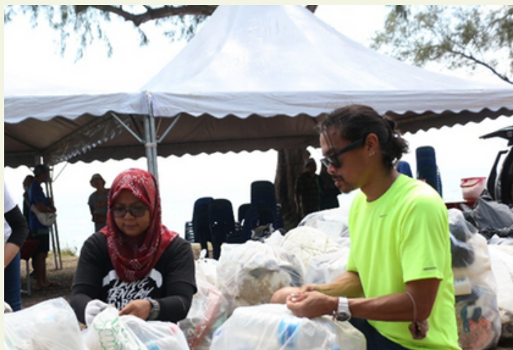
Tanjong Jara Resort guests and our staff sorting through recyclable materials.

In total 442 kg of waste was removed from beaches around Tanjong Jara Resort, of which 119 kg was recycled. The empowerment of the community to take care of the local environment is an incredibly important part of conservation work, as without local support conservation projects struggle to be sustainable. Cleaner beaches will result in a more suitable habitat for marine species which make their home in the area, including sea turtles. This also reflects positively on guest satisfaction as they will enjoy cleaner beaches during their stay at Tanjong Jara Resort.