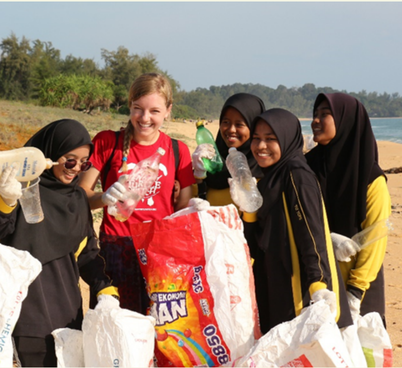
Local school students participating in a beach clean-up event in 2019.