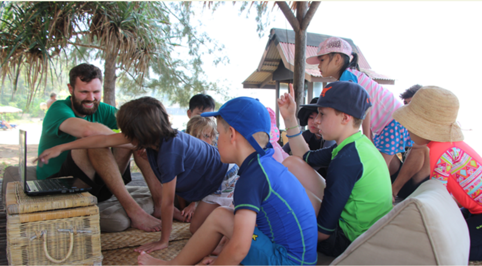
One of our former interns interacting with guests at the Visitors' Hut.

Our Visitors' Hut has been a mainstay feature at Tanjong Jara Resort since 2016. Since then, we have welcomed thousands of TJR guests and hundreds of school children to our Visitors' Hut where we are able to educate the general public about sea turtle conservation in Malaysia.