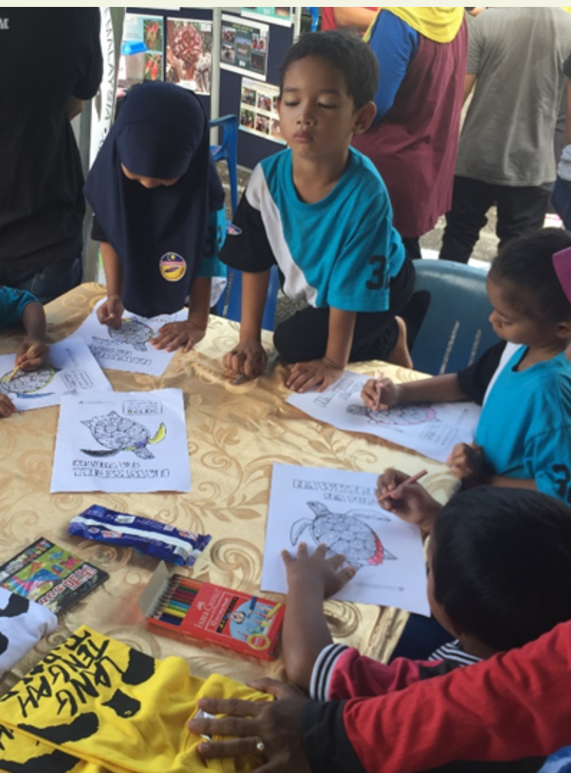
School students joining us for turtle-themed activities in 2019.

In 2019 we successfully continued our educational school outreach programmes in Dungun, Terengganu. The main objective of these programmes was to raise awareness about the importance of conserving sea turtle populations and the environment. The target audience were local students in Dungun, Terengganu. Interactive talks which highlighted the way marine pollution threatens sea turtles, as well as information on their life cycle, were presented by the Lang Tengah Turtle Watch team to 225 students at a local school in Dungun.