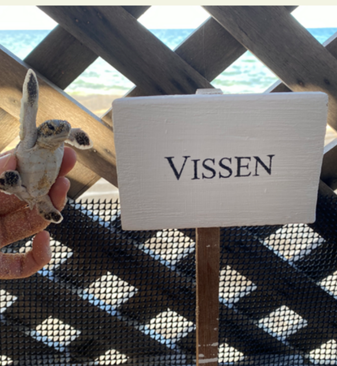
A photo of a hatchling with a nest marker to be sent to the adopter.

2020 has seen the second-highest number of nests saved since the programme started in 2016, with a total of 112 nests, of which 108 nests were adopted. Of these, 21 were critically endangered painted terrapin nests and the remaining were green turtle nests. Despite being unable to gain new adoptions from resort guests for several months due to the resort's closure during the movement control order, we were still able to continue purchasing eggs from local tender holders and fulfilling adoptions on our waiting list from the previous season. The strong support for the project shown by Tanjong Jara Resort guests in 2019 provided us with the necessary funds to save turtle eggs in 2020 despite the lack of revenue from the nest adoption programme.