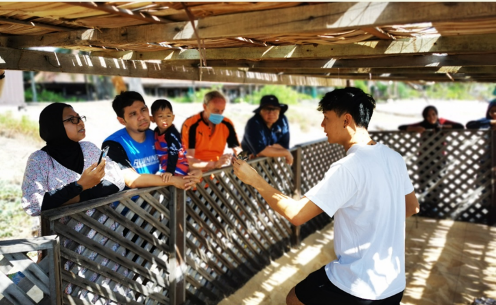
Guests seeing a hatchling during a nest inspection.

Nest inspections provide an opportunity for us to engage resort guests in the work we are doing and offer an interactive and informative experience. We check our green turtle and painted terrapin nests in the latter stages of incubation, and inspections allow us to identify the development stage of the eggs, as well as any potential problems in the nest.