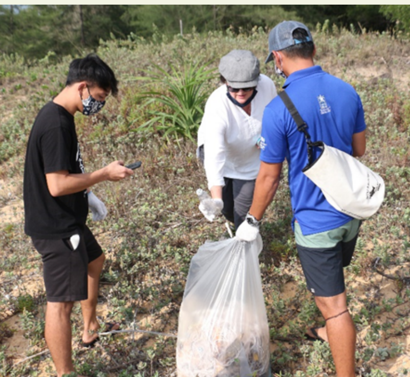
Our team and resort staff participating in a beach-clean up event together.