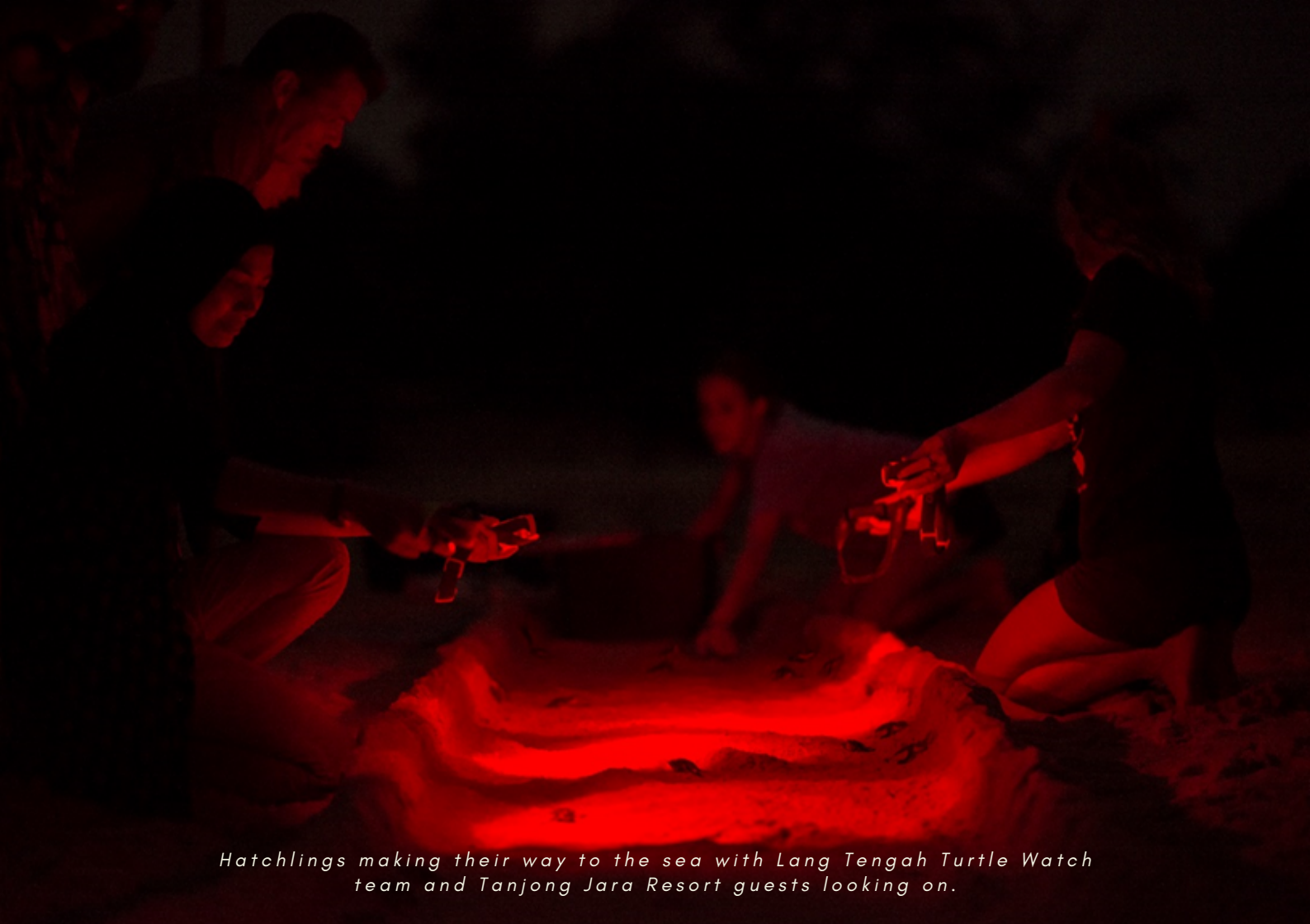
Hatchlings making their way to the sea with Lang Tengah Turtle Watch team and Tanjong Jara Resort guests looking on.