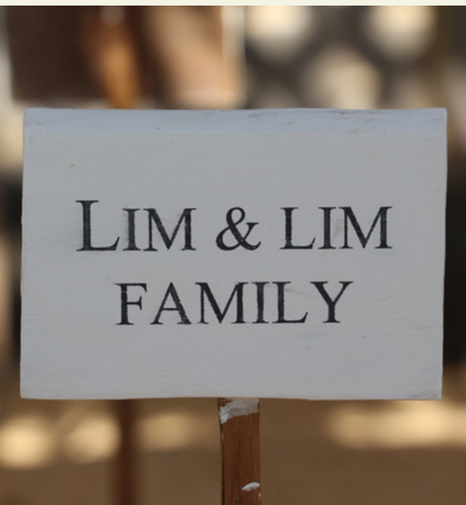
One of the first nests adopted in the 2020 season.