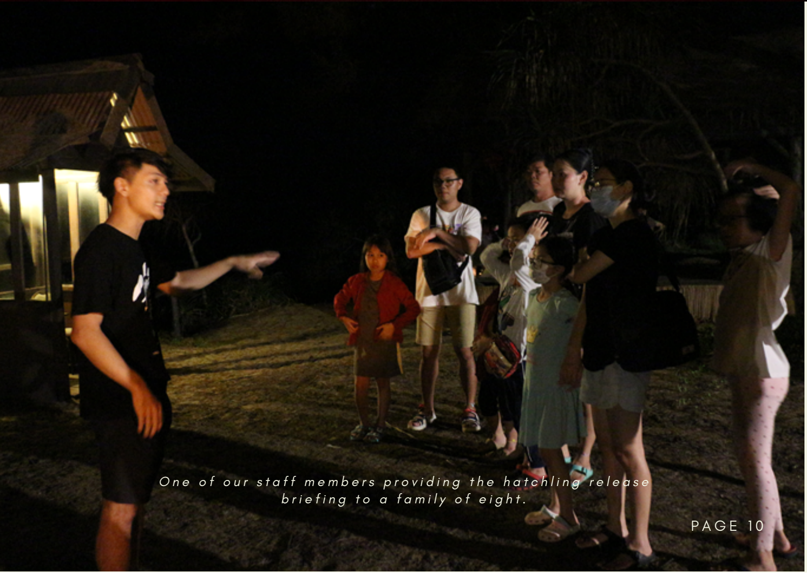
One of our staff members providing the hatchling release briefing to a family of eight.