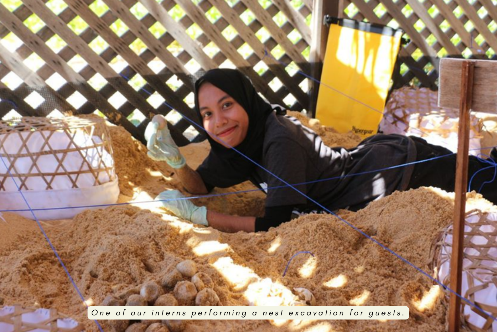
One of our interns performing a nest excavation for guests.