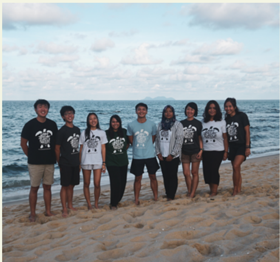
Our team in October 2020.