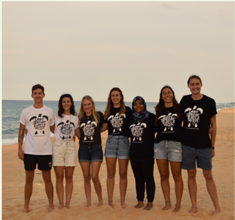
Our team in March 2020.

Building on a strong organisational backbone plus local talent we adapted throughout the pandemic, luckily, we were able to quickly recruit Malaysian interns and continued the rest of the season, saving as many turtle eggs as possible.