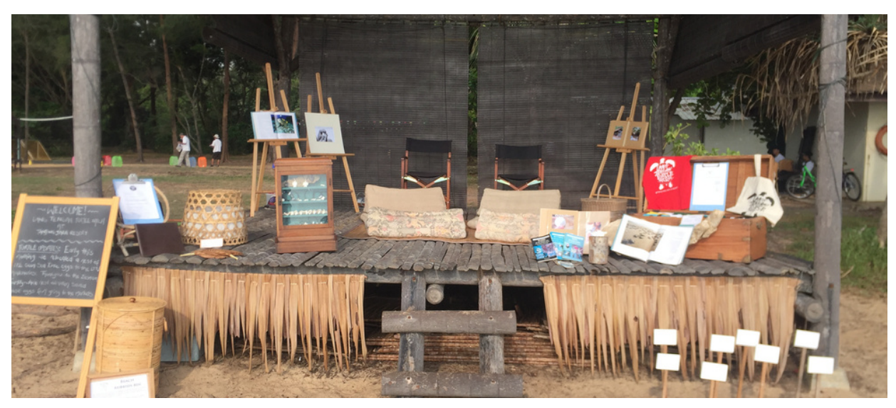
Visitors' Hut completed.

This acts as a base for our staff and interns during the day, as well as providing an informative space for guests to come and find out more about the project, sea turtles and conservation at large by talking with our team and looking through our extensive bank of resource materials.