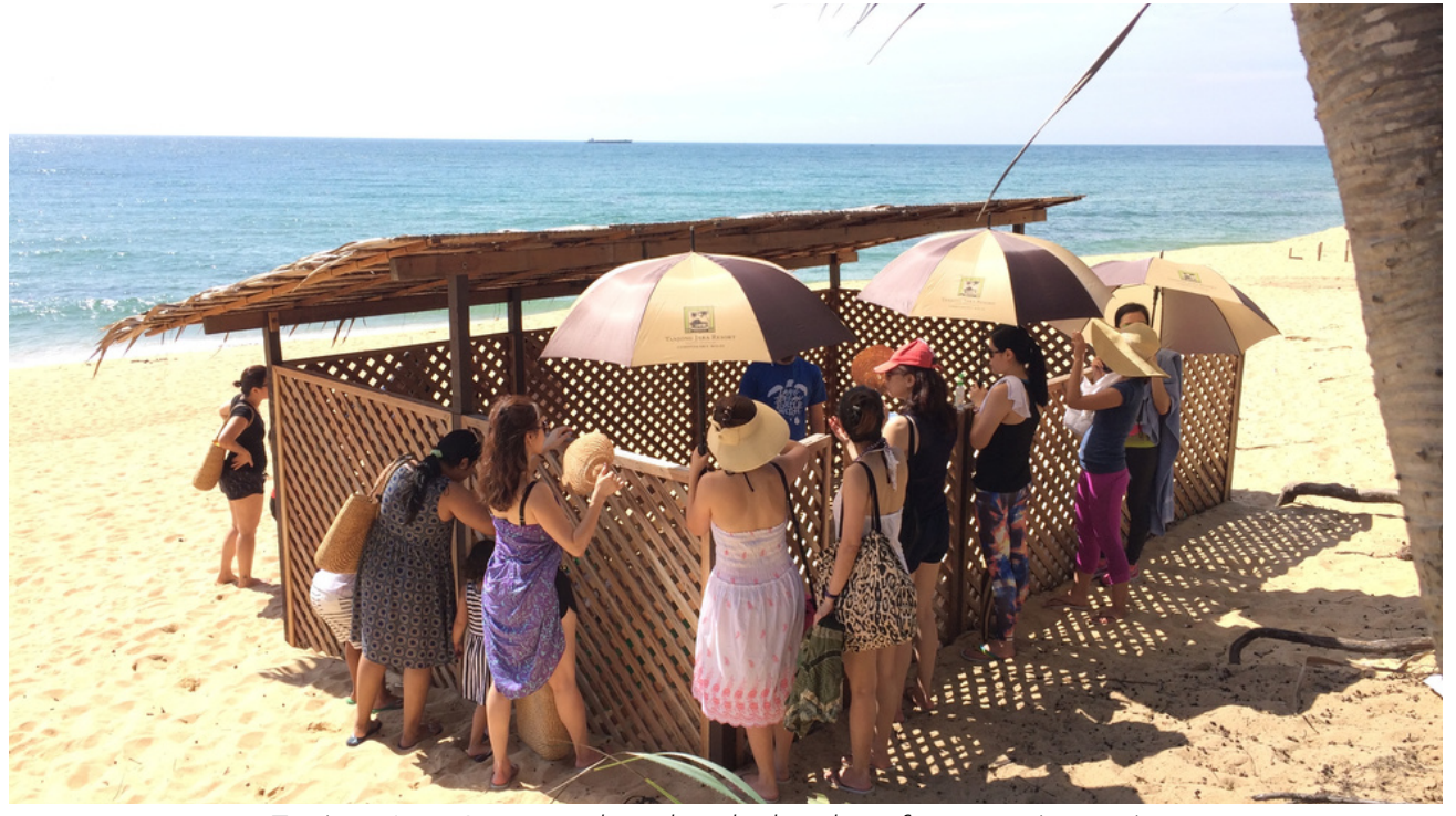
Tanjong Jara Guests gathered at the hatchery for a nest inspection.