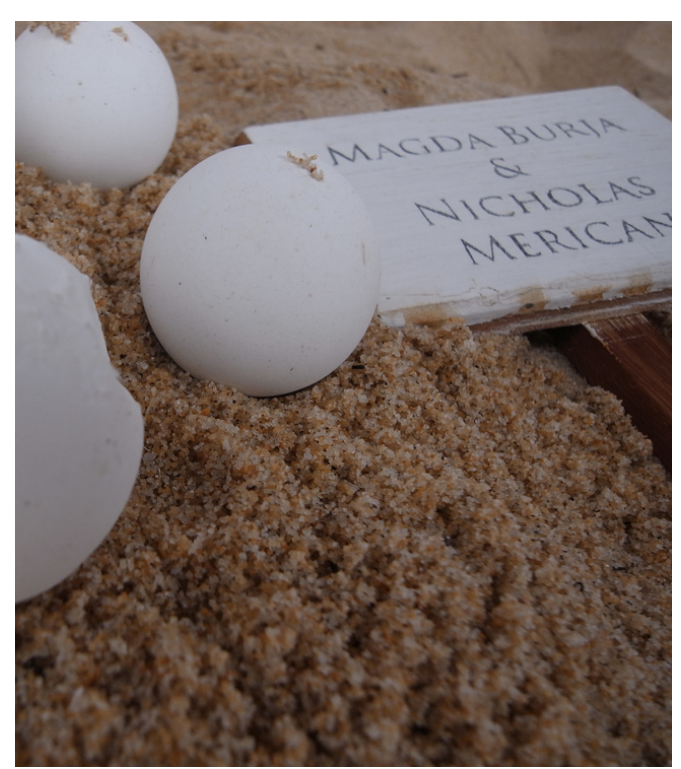
Nest adoption update, with the egg in the foreground thinning and close to hatching.

Once adopted, the nest is then marked with a handmade stake, bearing the name of the adopter's choice. Regular updates are then sent to the adopter, giving details on the development of the nest, any problems that may have occurred and the reasons why. They are also invite to come back and stay at the resort around the estimated time of their hatchlings' release.