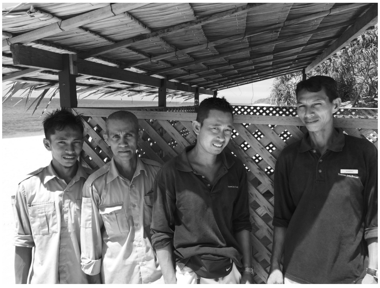
Our dedicated team of rangers.

In order to patrol the beach for nesting turtles, we employed a dedicated team of local rangers, who are also staff at the resort. They also help us with hatching releases.