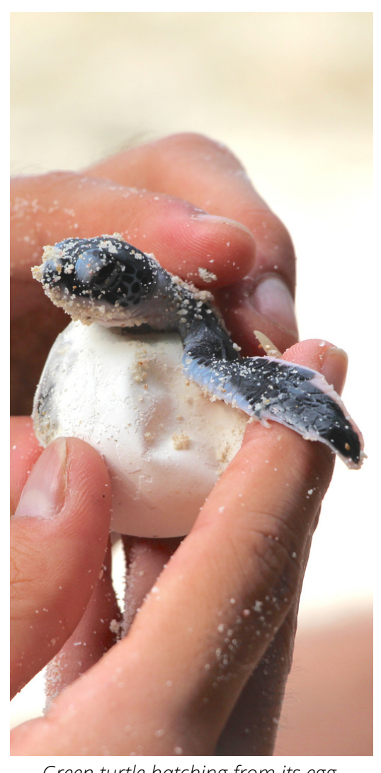
Green turtle hatching from its egg.