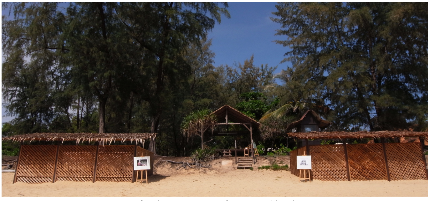
After the construction of our second hatchery.

This programme has been far more successful than we anticipated, and hence we had to use money we received from the guests in the form of donations to build a second hatchery to house all the nests.