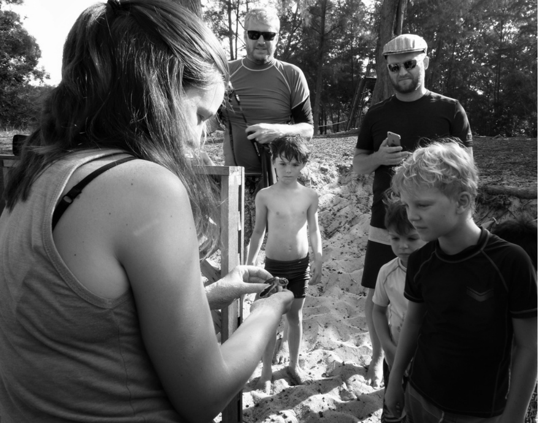
LTTW team showing Tanjong Jara guests a newly hatched turtle.

Throughout these nest inspections our team deliver informative talks to the guests, explaining details about the incubation process, the life-cycle of the turtles, as well as myriad of other biological, ecological and behavioural details about these majestic and their creatures surrounding environment.