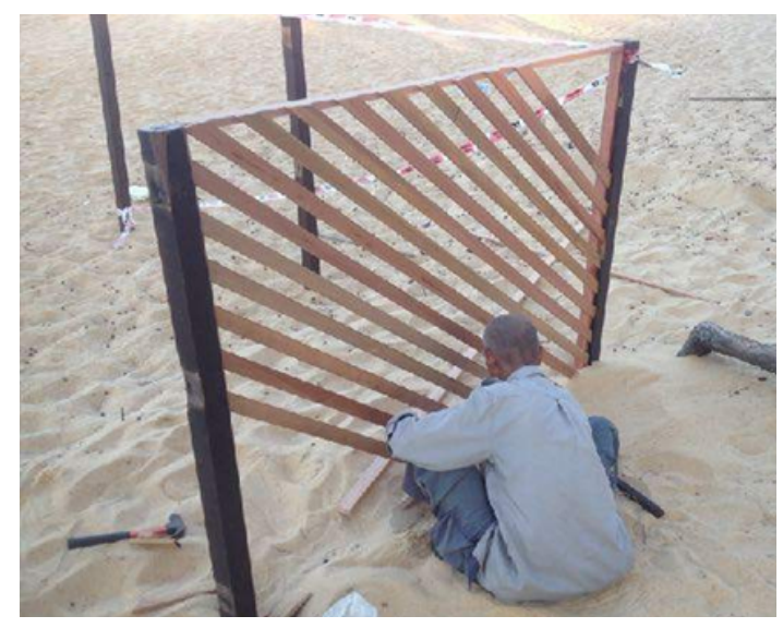
Constructing the hatchery.

The hatchery was constructed using a simple wooden trellis and a traditional roof of attap nipah, in order to blend in sympathetically with the natural, simple, yet elegant aesthetic of the resort.