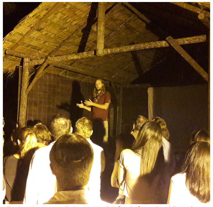
Tanjong Jara guests being given a briefing before a hatchling release.

When guests arrive at our Visitors' Hut there are given a talk on what is about to happen, and a briefing on the 'dos and don'ts', to ensure the release happens smoothly and minimises any risk of unnecessary stress to the hatchlings.