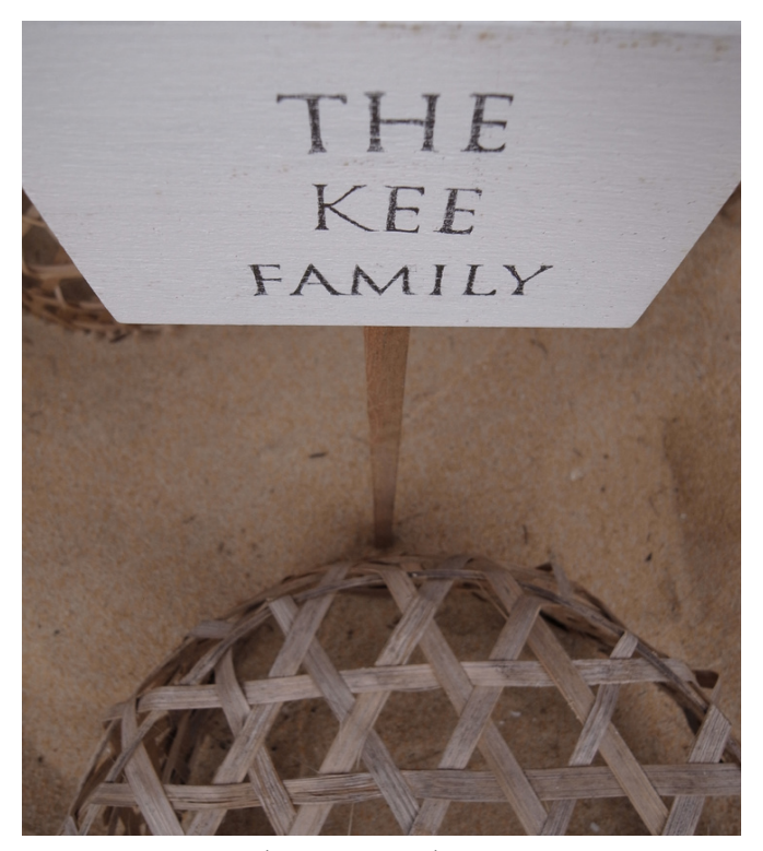
The 'Kee Family' nest