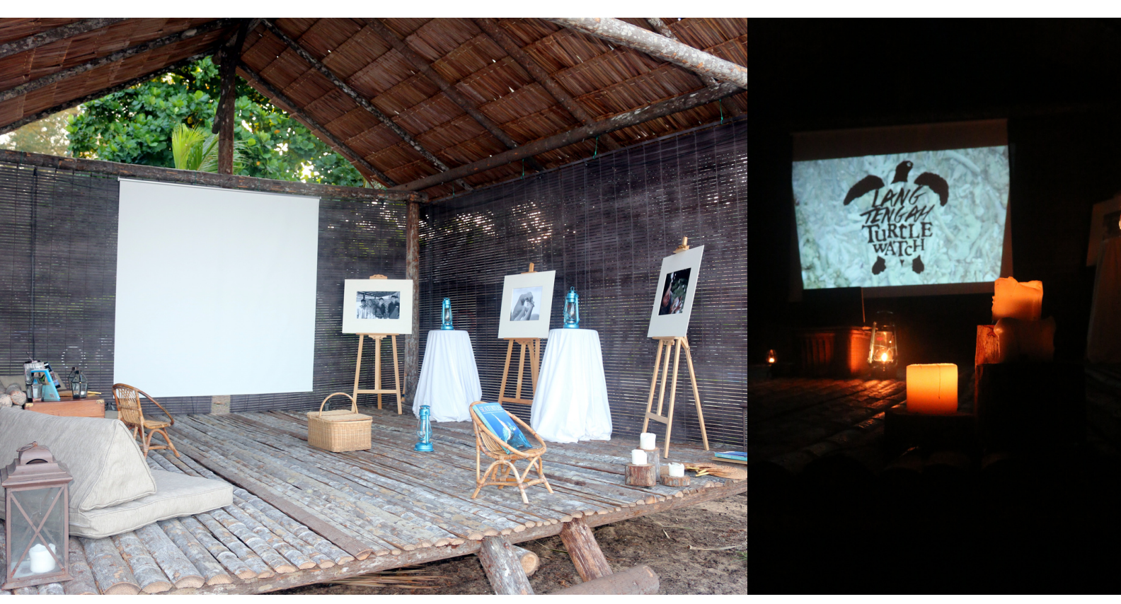
Our Visitors' Hut ready for the official launch of Lang Tengah Turtle Watch at Tanjong Jara Resort.

When resort guests pledge to adopt a nest, we contact tender holders along the Terengganu coastline who normally send their eggs to the market as food. When they get a turtle laying, they deliver the eggs to us and we pay them the market price. Then we incubate the eggs in our hatchery.