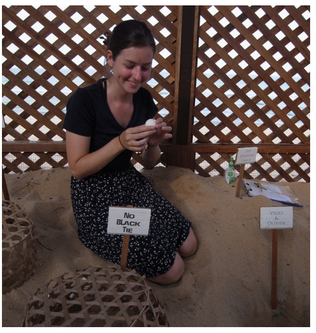
Inspecting a nest for signs of fungal infection.

Every week we pass the daily schedule of our nest checks to the staff at the reception, Teratai Bar and Nelayan Restaurant. This means guests are informed of when they can come over to the hatchery and observe these inspections. This offers guests an interactive and informative experience, as well as a rare opportunity to see turtle eggs and — if lucky — hatchlings.