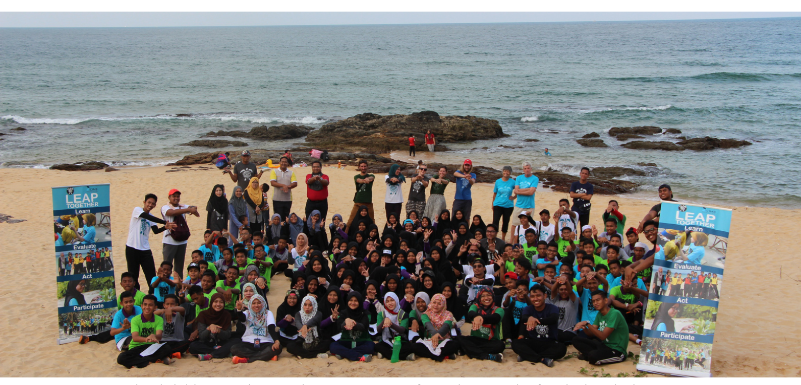
School children, students and our team posing for a photograph after the beach clean-up.

This initial clean-up managed to remove 592 kg of rubbish from the beach, just by the students alone. We feel this helped not only the turtles but the resort too, as we had often heard guests being upset about the amount of rubbish they encountered whilst walking along the beach.