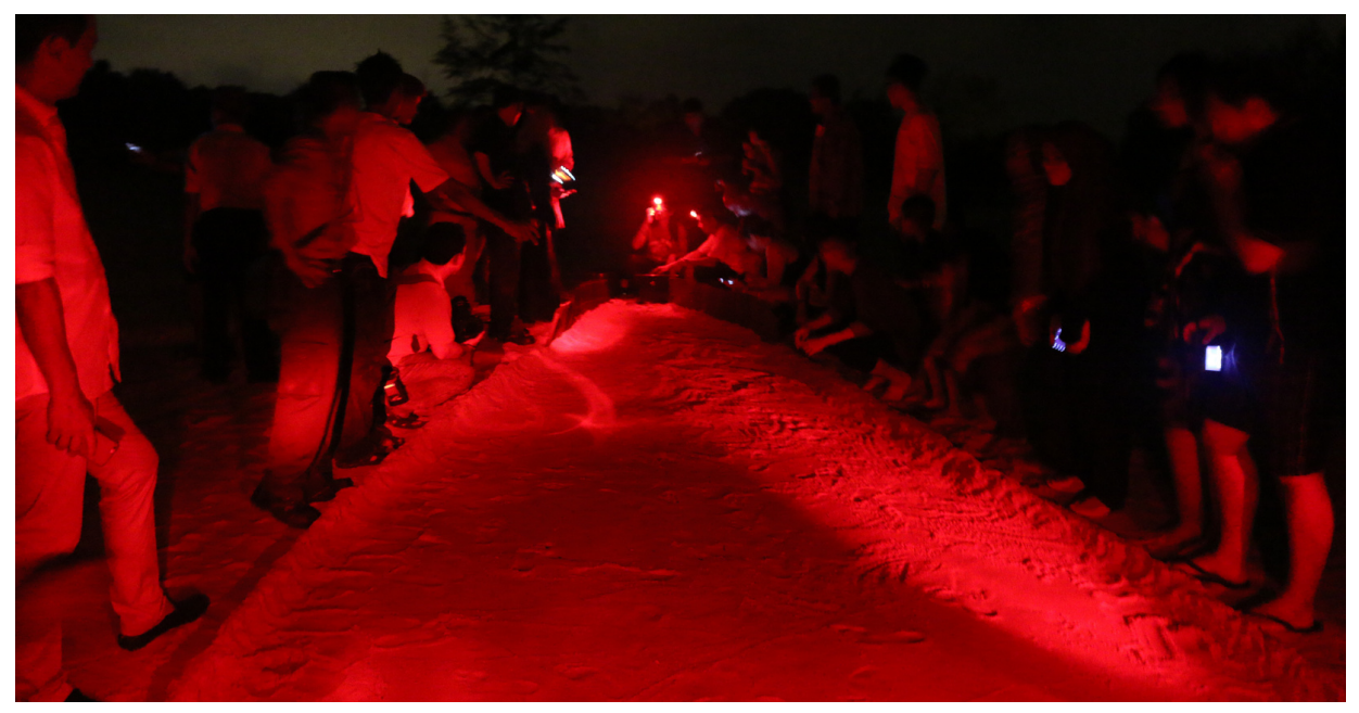
The 'runway' lined with guests ready to release the hatchlings under red light.

The hatchings and guests are then taken down the beach, away from the bright lights of the hotel — which can disorientate the turtles — to a spot where a 'runway' is made. Hotel guests line the runway, funnelling the hatchlings to the sea and cheering them on.