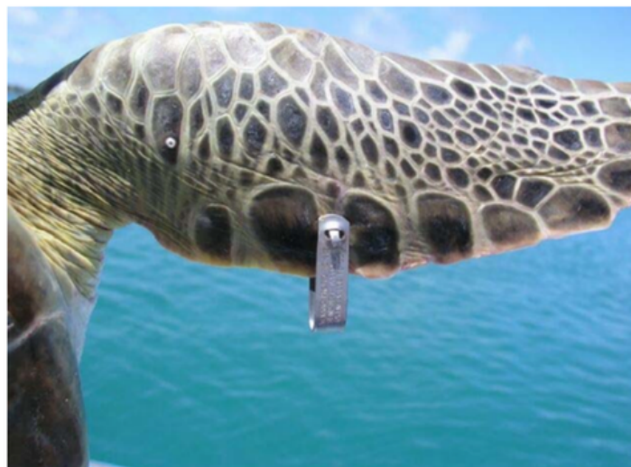
Figure 2. A correctly cinched identity tag, placed between the second and third scales. Note that the tag shown has been secured 'upside-down' (Eckert & Beggs, 2006).

A method known as 'double-tagging' was employed, whereby a tag is placed on both front flippers. This is to ensure the greatest chance of the turtle retaining at least one of its identity tags over the course of its migration period. If one of the tags is missing upon an individual return to the nesting beach, then another tag is inserted and the identity form for that individual is updated. Only participants trained in tagging sea turtles were allowed to undertake this procedure, in the event of their absence and the arrival of a new mother, the tracks in the sand were measured at their widest point. When a subsequent new mother came ashore her tracks were also measured to see if they matched those of the previous, untagged mother.