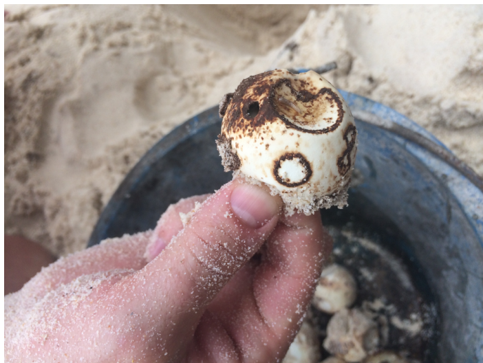
Figure 3. An egg from a nest that had been infected by termites on Turtle Bay.

A new predator became apparent during the 2014 season – termites (see Table 2 & Figure 3). There is currently no literature existing that relates to the predation of sea turtle eggs by termites. This presents the opportunity for an area of interesting, novel research that could be conducted on Pulau Lang Tengah in the 2015 season. Loss of eggs to other predators, mainly crabs and monitor lizards could be stunted by improving the protection of the nests by increasing the amount of daytime patrols along Turtle Bay.